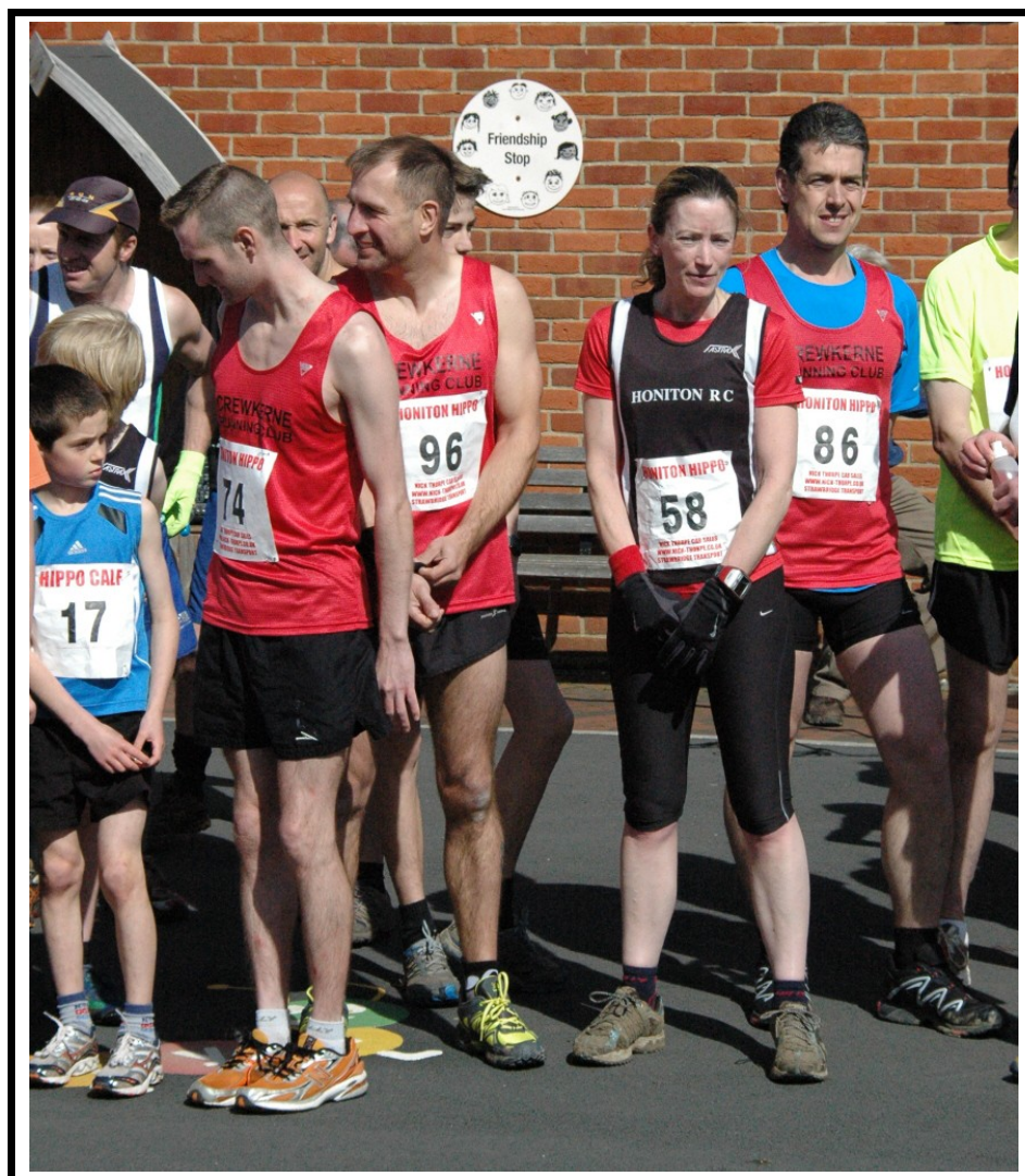
CRC runners lining up at the start of the Honiton Hippo